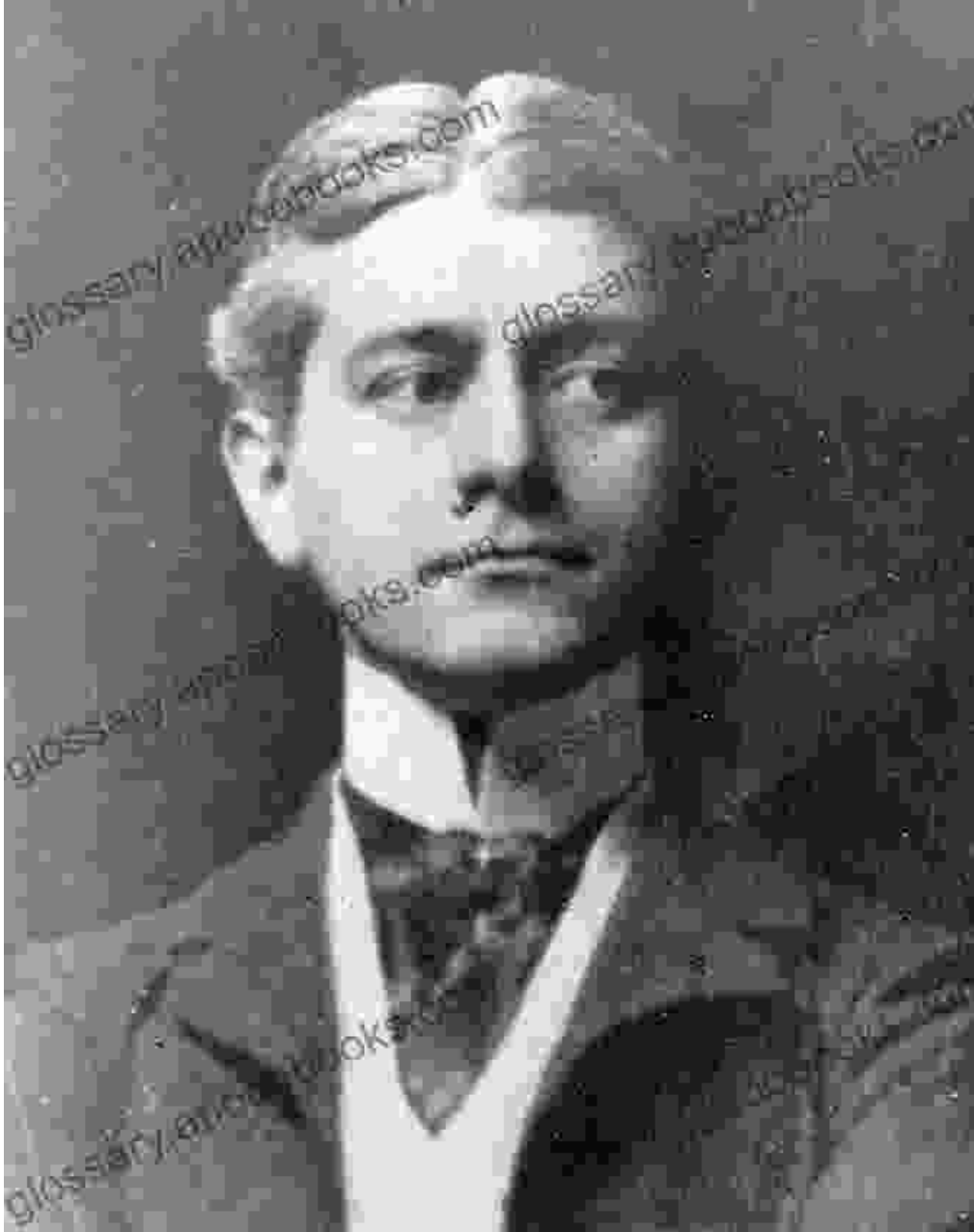
Frank Norris, c. 1900

In McTeague , Norris depicted the Central Pacific Railroad as a symbol of the corrupting power of money. He also wrote about the devastating effects of the railroad's construction on the environment.