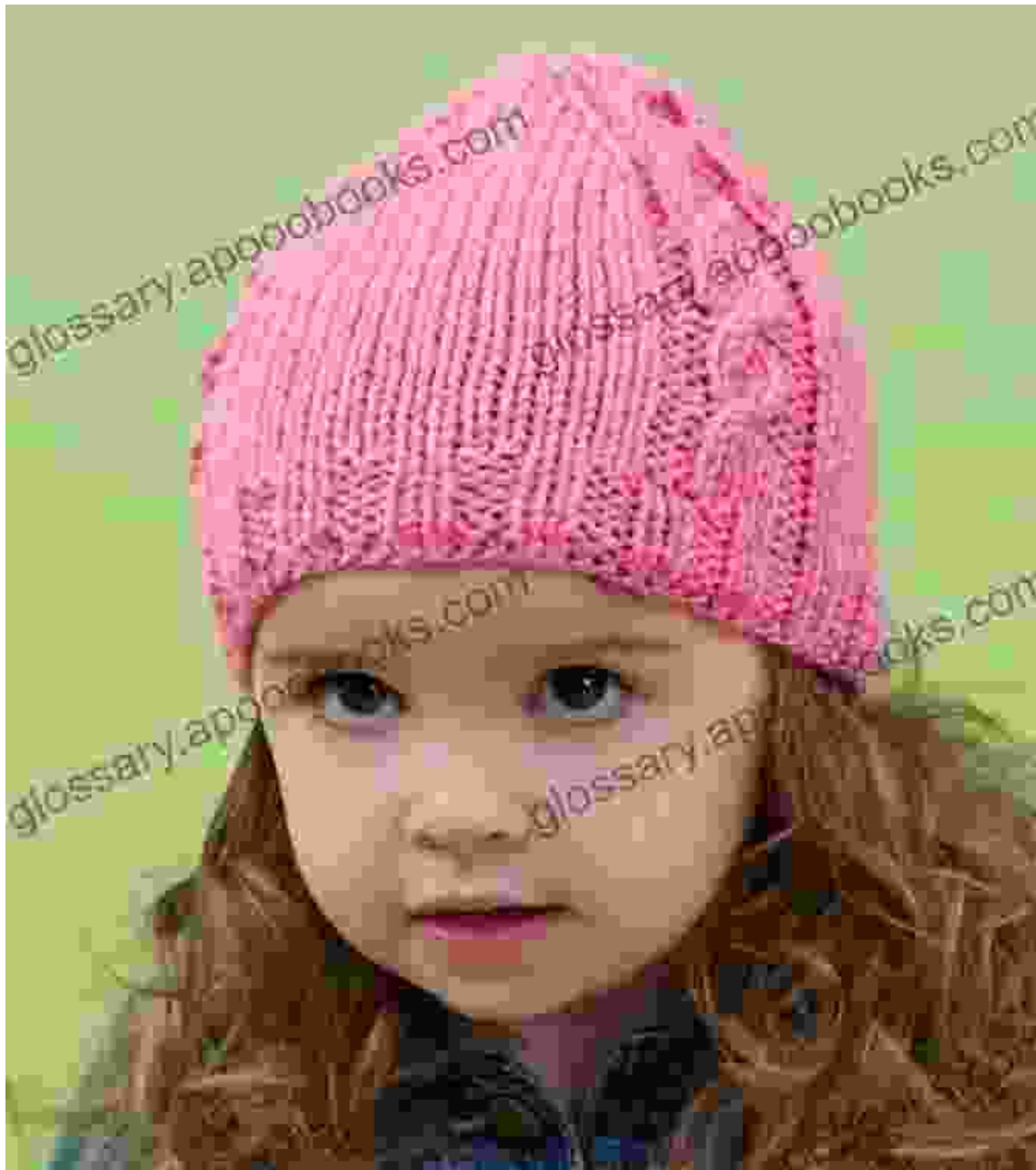
Pretty in Pink: A charming Ssk Baby Cable Pattern Hat with a touch of whimsy