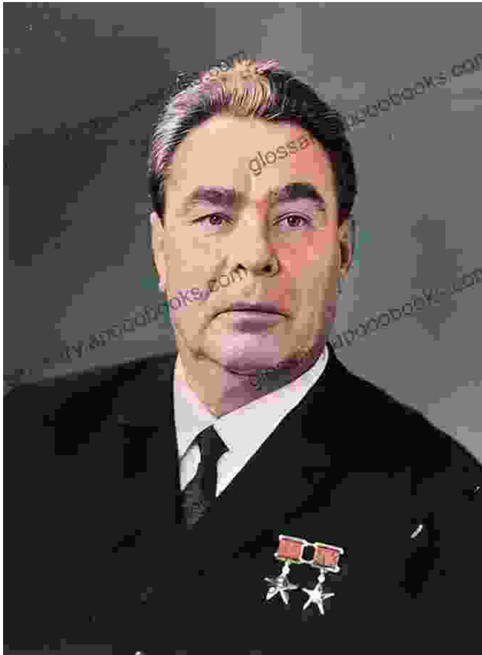
Leonid Brezhnev, leader of the Soviet Union from 1964 to 1982

Leonid Brezhnev rose to power in 1964. His leadership ushered in a period of stability and economic growth, known as the Era of Stagnation.